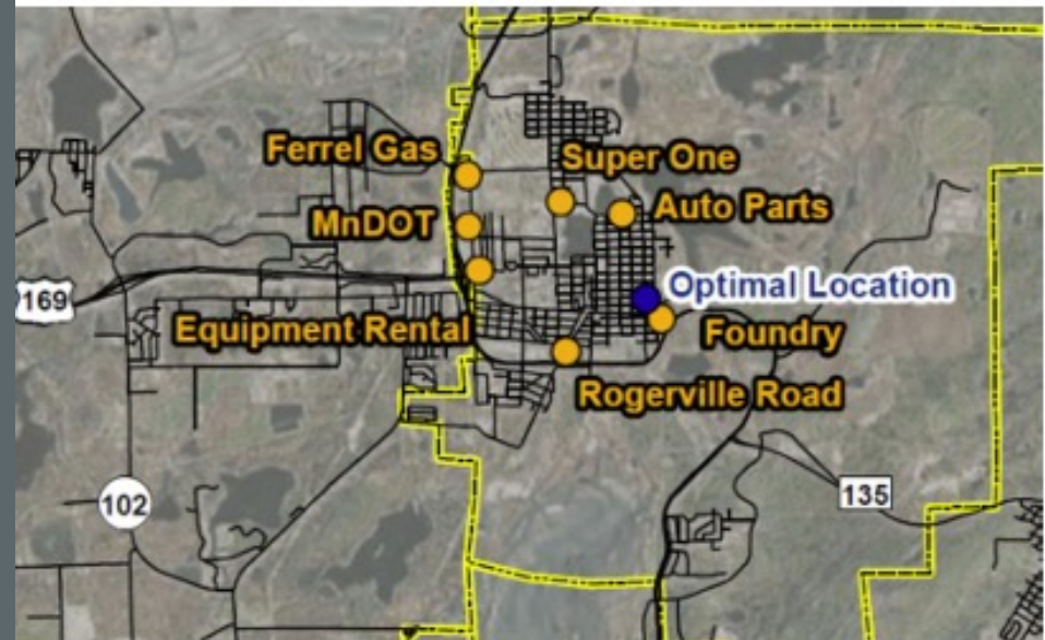
All Sites – Reference Fig 5, Appendix B

**First platted in the 1890s, and residential homes were constructed as early as 1905. Duluth, Missabe, and Iron Range (DM&IR) Railway by 1915 and serviced open-pit iron ore mining operations, support industries, and a coal gasification plant. Adjoining property concerns: former Staver Foundry and several fueling stations & 100+ year history of residential, commercial, industrial use**